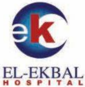
Al Eqbal Hospital Alexandria