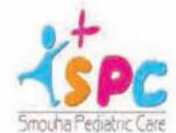
Smouha Center for Pediatrics Alexandria